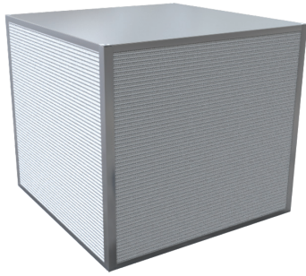
Enthalpy core heat exchangers are easy to maintain with no moving parts